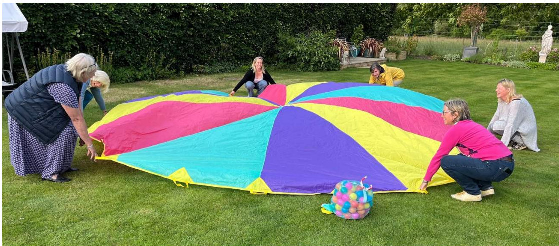
Practising for Messy Church.