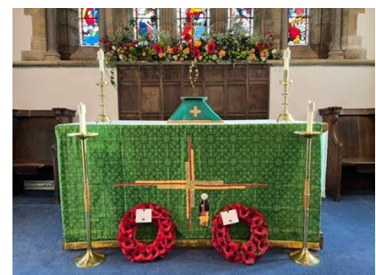
Infant school children's poppies; wreath marking VE80; Remembrance Sunday display.