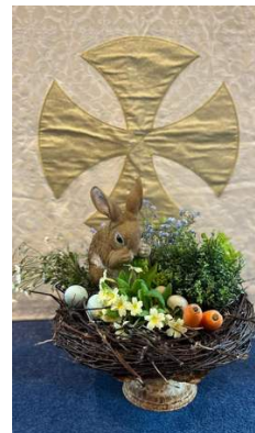
Easter at St Giles Graffham