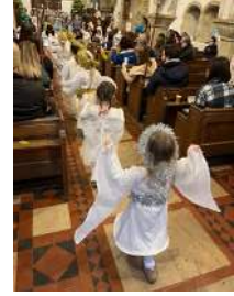
Child's Christmas card of St Giles Church; Advent wreath in church; Christmas illuminations; Nativity angels processing..

Following our traditional Advent Service with Seaford College choir, a full programme of seasonal services took place in December. In addition to Infant School Services and Nativity, this included Lessons and Carols with gathered choir, and ever-more-rousing carol singing in the Foresters Arms. A full church attended our Christmas Eve Crib Service, with animals in the tower 'stable', enjoyed by very many families. This was followed once again by a candlelit first Eucharist of Christmas, providing a peaceful, serious beginning to Christmas. A Christmas Day Family Eucharist on Christmas Day made Christmas joyful for all who came.