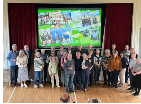
Wintershall Life of Christ; Singing at Songs of Praise; Reception for magazine distributors.