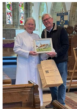
Harvest Festival at St Giles; Presentation to retiring PCC Secretary.