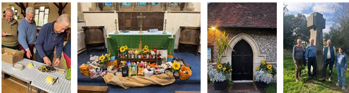
Lent lunchers; Harvest offerings for Stonepillow; Sponsored walk to Abinger Roughs.

The Annual Harvest Meal reverted to a Supper in 2025, this year local villagers provided entertainment with folk songs and poetry readings. This is a "Bring & Share" event and it is amazing how the right number of main course dishes and desserts come together. Donations from this event are given to the Foodbank while produce from the Harvest Festival Services is taken to Stonepillow.