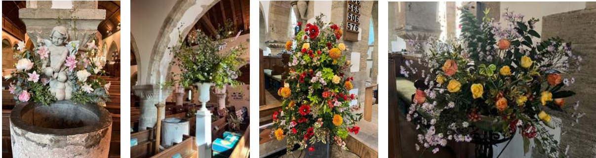
A selection of flower arrangements for special occasions in 2025.

A dedicated group of church volunteers maintained the church in a clean and welcoming condition, with a rota of flower arrangers ensuring the church interior was enhanced by floral arrangements, most spectacularly evidenced during the 150 th Rededication Anniversary Service and at Easter and Christmas Services. Filled planters on either side of the church door continued to contribute to the church's welcome.