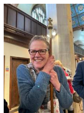
Unity prayer lunch at pavilion; churchwardens at Petworth Deanery Year of Faith Service

The 950th anniversary of Chichester Diocese Year of Faith Deanery Service at St Mary's Petworth was also well attended by our parish, with churchwardens processing and testimony by a young adult member of our church. This inspired further testimony of congregants' faith journeys in our church during the weeks of Lent.