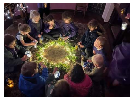
Messy church Goes Wild at Lavington Stud and Messy Advent Worship at All Saints Chapel.