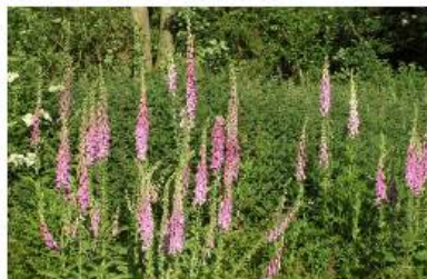
Come and enjoy the beautiful wild flowers!