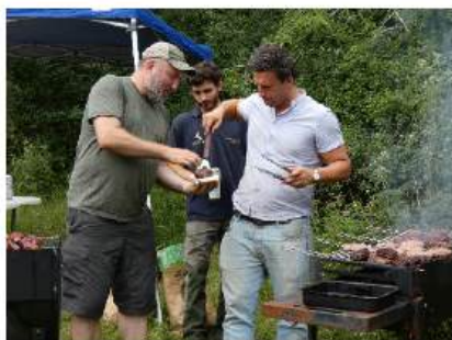
Westerlands will be providing their delicious burgers!

Meet outside St Giles Church at 9.45 am. Picnic on the Downs for all ages – two and four legs! Bring a picnic and join us in Bowley's Reserve at midday.