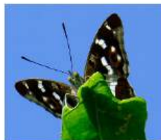
Maybe spot a purple emperor!