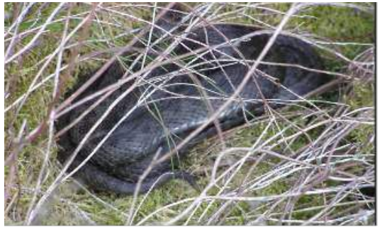
An Adder, with its continuous zig-zag pattern on its back (left), and a Black Adder.