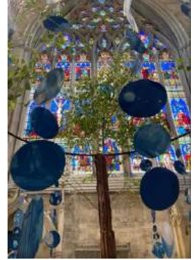
The school's spectacular Chichester Cathedral's Festival of Flowers display.

Sports days By the time you read this, our sports days will have come and gone – Duncton's on our own school field on Thursday 18 June and Graffham's at the village Rec the following day.