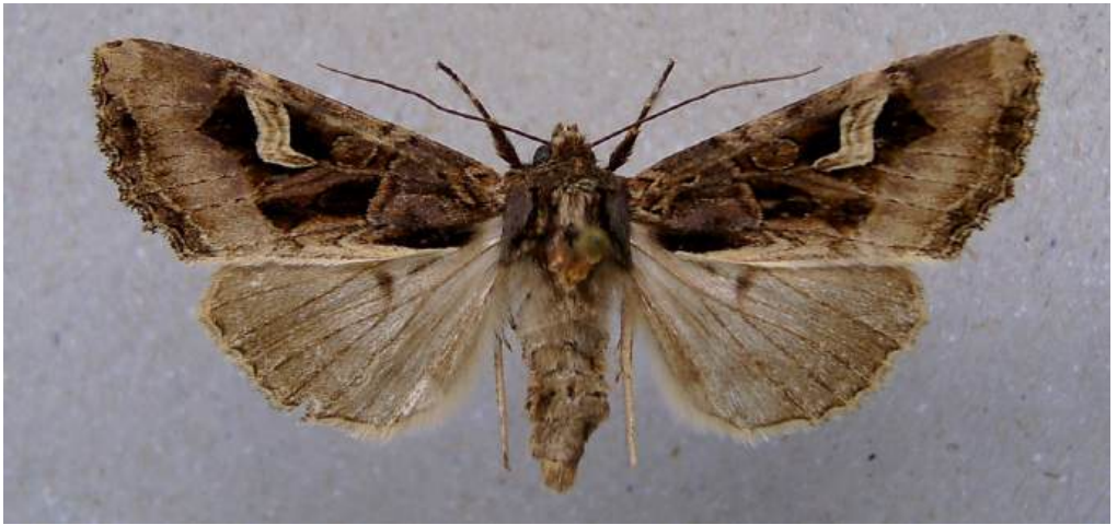
A Flame Brocade, with its distinctive flash of lightening on its wings.

Unsurprisingly, the Flame Brocade's population dwindled. There were only a few recorded after 1900, and this particular lepidopteral gold rush came to an end. The moth vanished completely from Britain and lived in exile across the Channel.