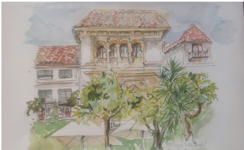
Watercolour of a Old Marbella Square by Sue Hill