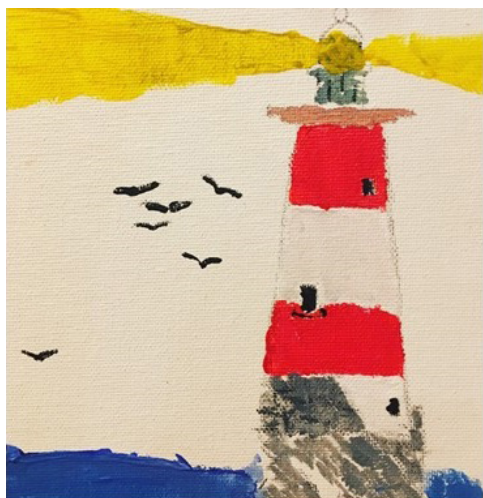
"A Beacon of Safety in the face of adversity ... thank you NHS" Gene aged 10