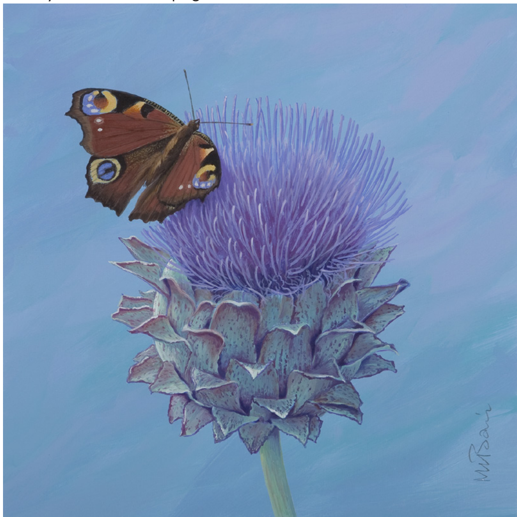
Peacock butterfly by Clive McBain